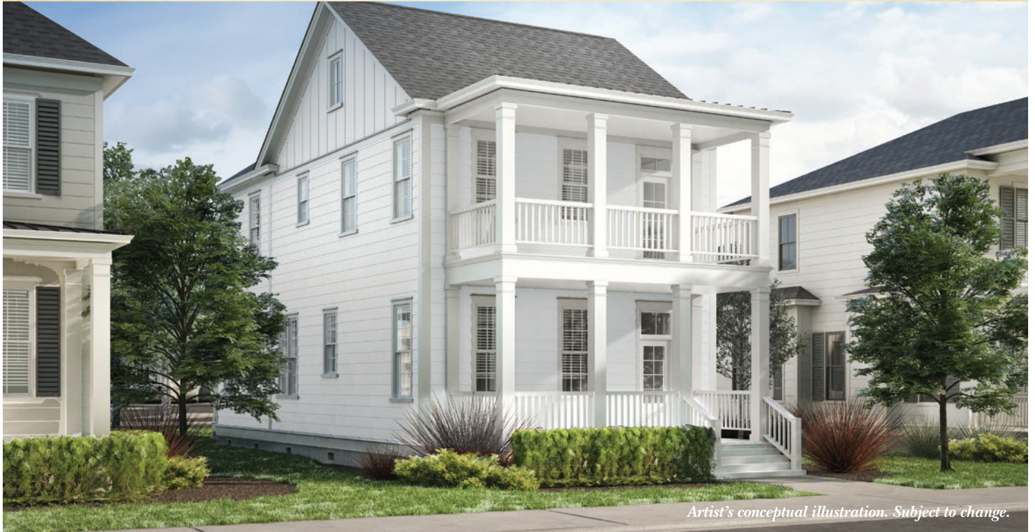
Artist's conceptual illustration. Subject to change.