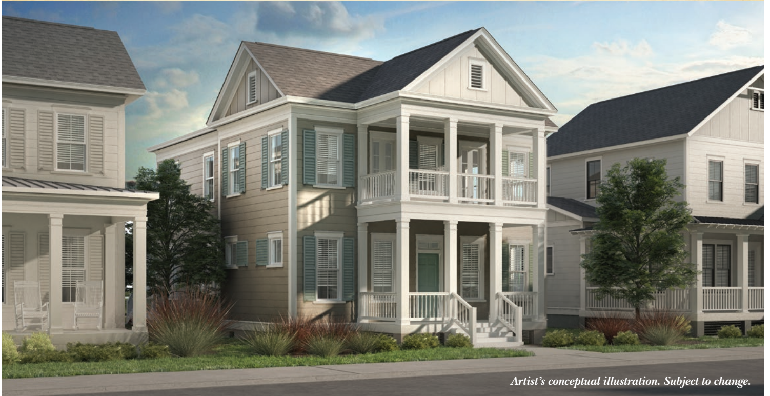
Artist's conceptual illustration. Subject to change.