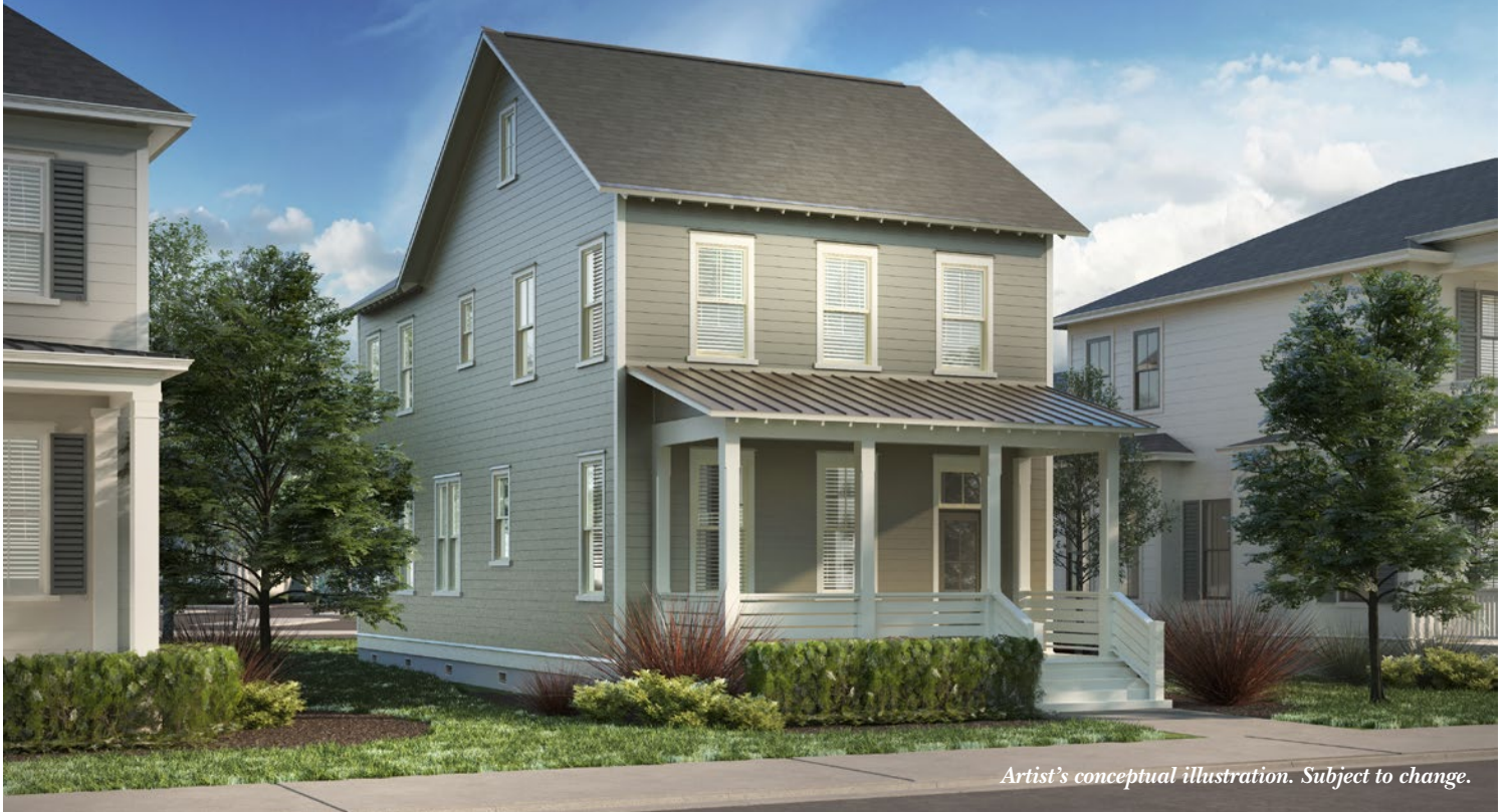
Artist's conceptual illustration. Subject to change.