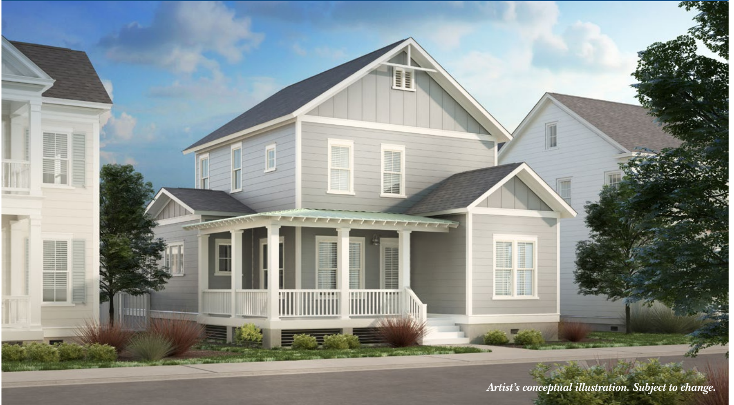
Artist's conceptual illustration. Subject to change.