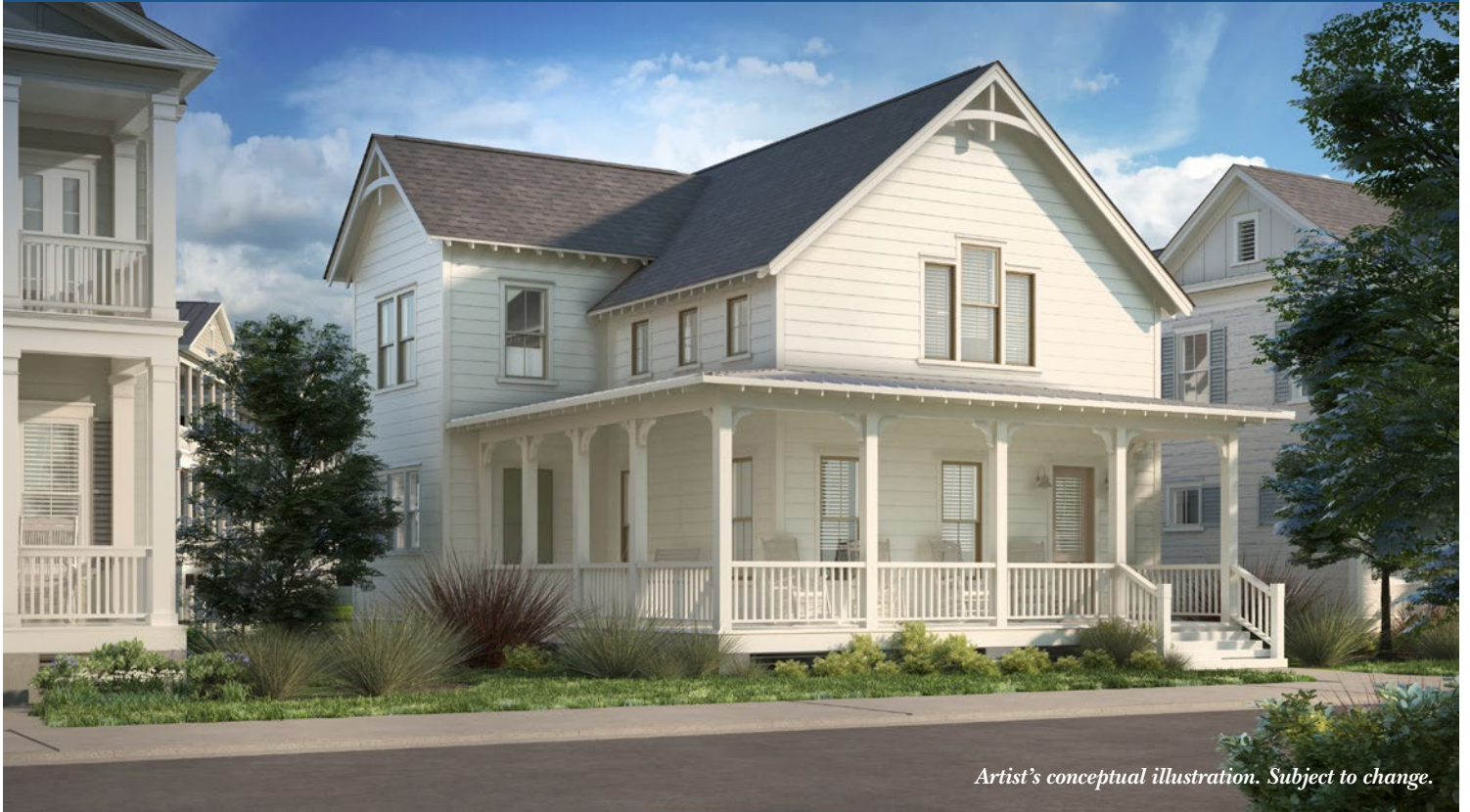
Artist's conceptual illustration. Subject to change.