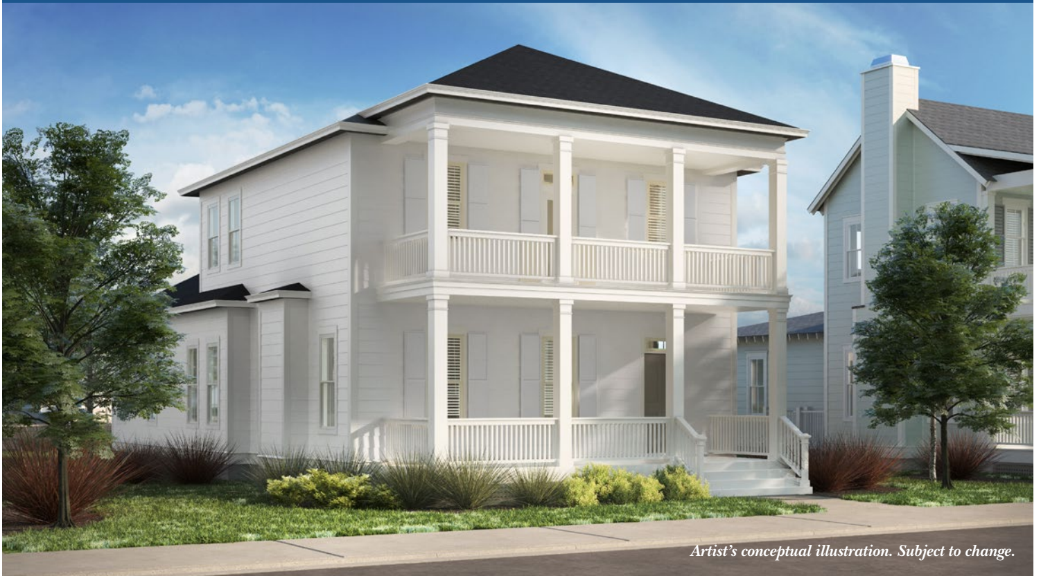
Artist's conceptual illustration. Subject to change.