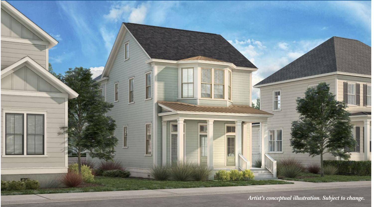
Artist's conceptual illustration. Subject to change.