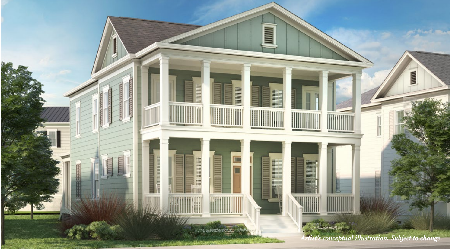
Artist's conceptual illustration. Subject to change.