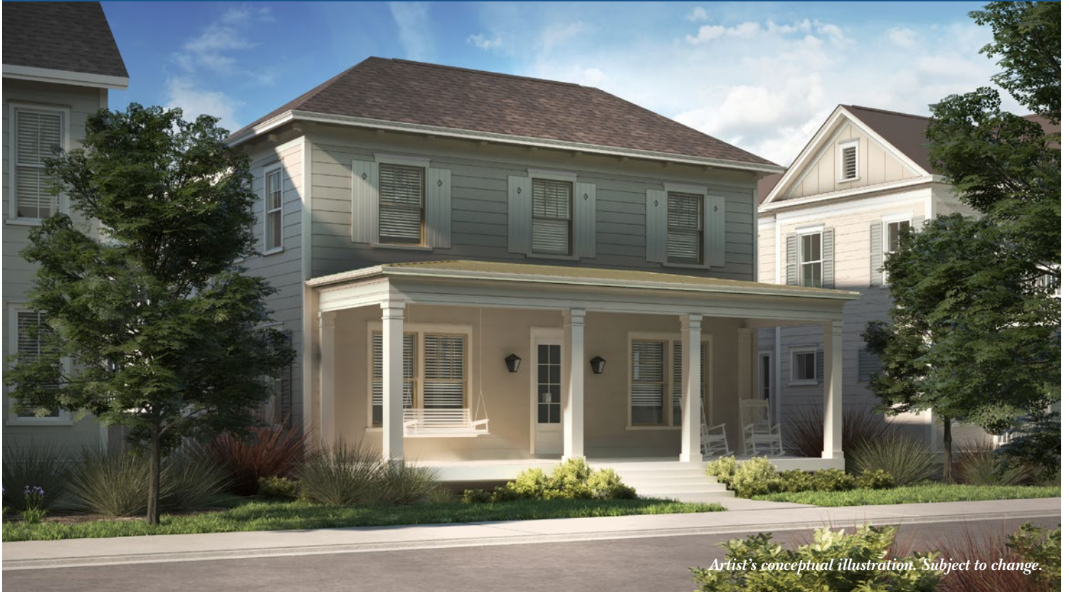
Artist's conceptual illustration. Subject to change.