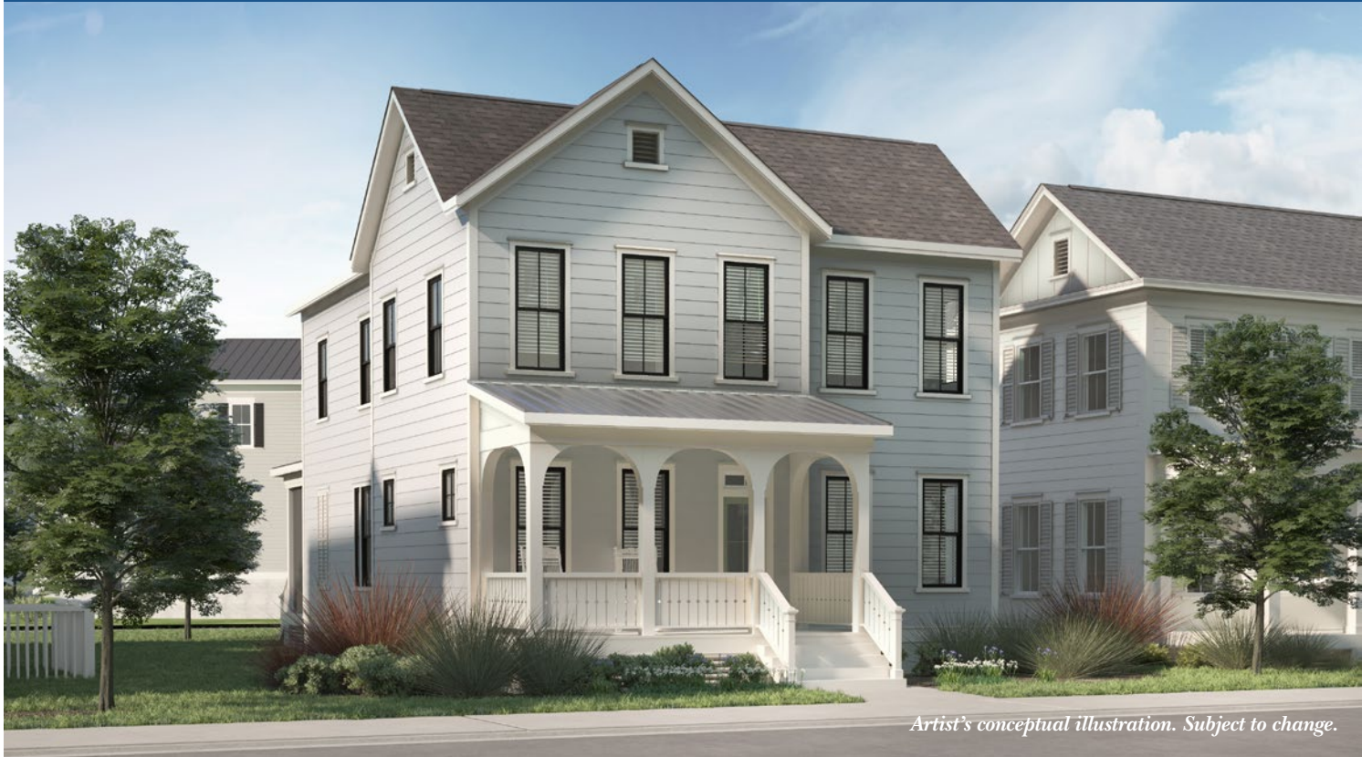
Artist's conceptual illustration. Subject to change.