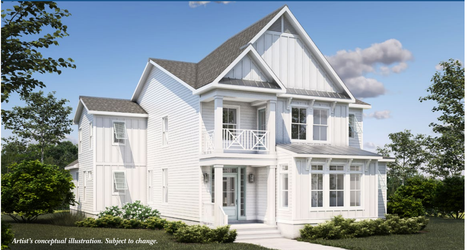
Artist's conceptual illustration. Subject to change.